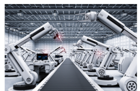
Smart Manufacturing & Industrial IoT