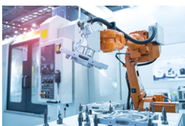
Metrology & Inspection

By deploying a rapid-fire storage media and setting a clear path for its transmission to PC components, NVMe provides the operative immediacy that responsive edge intelligence demands. Applications leveraging inference analysis to gain business insights, make decisions and perform independently access stored algorithms and mission-critical data at speeds exceeding human cognition.