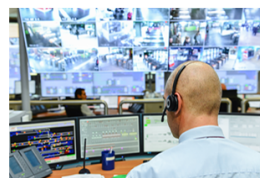
NVR Video Surveillance