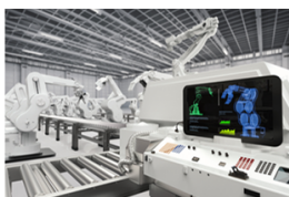
Machine & Computer Vision